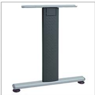
A= Antracite anthracite