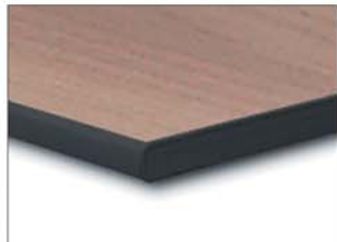
NN= Noce-Nero walnut-black