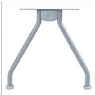
M= Alluminio satinato metallic