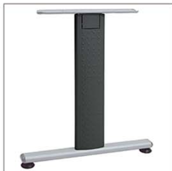
M= Alluminio satinato metallic