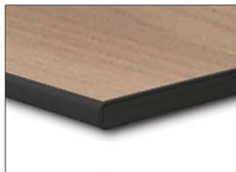
NN= Noce-Nero walnut-black