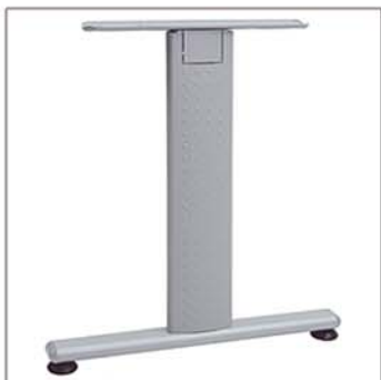
A= Antracite anthracite