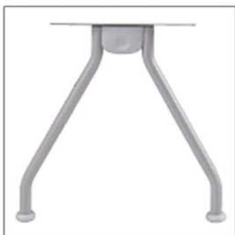
M= Alluminio satinato metallic